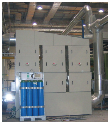
A•smoke 120 with side outlet

There are no moving components; this makes the filter unit very reliable. The external fan is to be placed at the clean-side to minimize wear & tear.